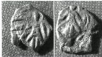
Type 7: Copper coin, 1.24g, 14mm

Rev.: Kushan styled standing human figure