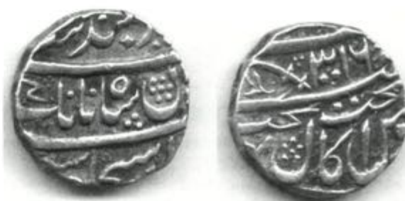
UNIQUE SIKH SILVER RUPEE THIS IS THE PROBABLY THE ONLY KNOWN COIN OF THIS TYPE. (YEAR 316 REFERS TO GURU NANAK ERA)

The weight of the coin is 11 g and the diameter is 21.5 mm. The image of the coin together with the legible legends on it is given below.