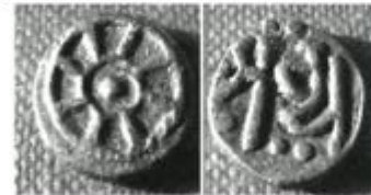
Type 1: Copper coin, 1.71g, 12mm, BMC 'Coins of Ancient India' pl.XIV,nos.1-5;