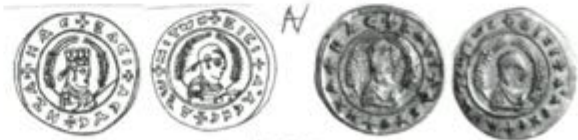
H. 21a Ezana's Christian