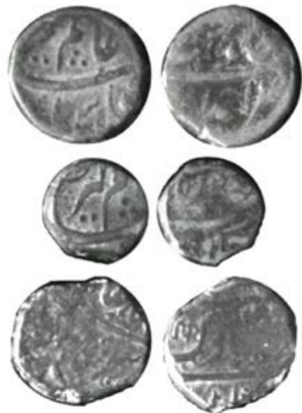
fig. 24, 24a, 25