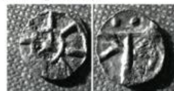
Type 2: Copper coin, 11mm, 0.56g

As coin no.1 but highly reduced weight and cruder execution of the designs