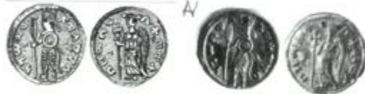
H. A30 Mhdys

19. A die link of a baxasabassin -side of the Noe coinage was found by B. Juel-Jensen, Two gold coins of king Eon of Aksum struck from unpublished dies , Num. Circ. 107, 1999, 44-5.