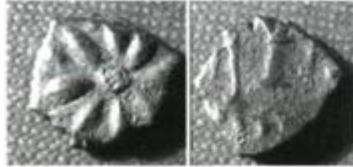
Type 5: Copper coin, 1.13g, 12mm

Obv.: The wheel has changed into a star symbol