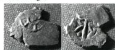
Type 3: Copper coin, 2.27g, 20mm widest diameter

As coin no.1 but highly reduced weight and cruder execution of the designs