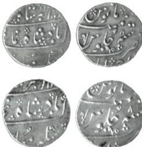
figs. 20, 20a

The tenure of Trimbakji Dengley as the kamāvisdār of Ahmedabad was but brief – it was brought to an end in late 1815 as a result of another intrigue involving the Gaikwads, the Peshwa and the British. Early in 1814, Fateh Singh II, the regent for Anand Rao Gaikwad appointed Gangadhar Shastri Patwardhan as a deputy to plead on the Gaikwads' behalf to the Peshwa in the ongoing dispute over monetary claims. Gangadhar Shastri was a staunch partisan of the British, a fact that the Peshwa resented. Trimbakji Dengley was involved in this dispute on the Peshwa's side, as he wanted to protect his own interests in Ahmedabad against the Gaikwads. The British had pledged protection to the Shastri, but in late 1815, while on a pilgrimage to the holy city of Pandharpur in Maharashtra, the Shastri was murdered one night while returning to his lodgings from the temple. Trimbakji was accused of being the perpetrator of this conspiracy and the British demanded he be handed over to them for eventual prosecution. The Peshwa vacillated for some time but in the end yielded to the British demand. Trimbakji was removed from his office as the kamāvisdār of Ahmedabad and handed over to the British. He was imprisoned in the fort of Bassein. The lease of Ahmedabad was transferred to the Gaikwads in June 1817 but, only a few months later, the British concluded a wider treaty with the latter, which allowed them to take Ahmedabad over.