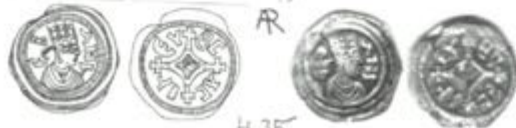
H. 35 Ebana