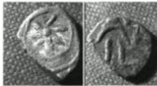
Type 6: Copper coin, 1.42g, 12mm

Rev.: The legend has been reduced to a crude design that has some similarity with the 'Kota character flanked by crescents' found on Kota copper coins