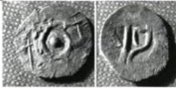
Type 4: Copper coin, 1.17g, 14mm

As coin no.1 but struck on an irregular planchet with ragged edges