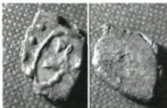
Type 8: Copper coin, 1.18g, 12mm

Rev.: Kushan styled standing human figure