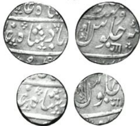
figs. 17, 17a

The Gaikwads continued to run the mint after the entire city of Ahmedabad came under their control in 1800. Most of the coins produced in the period 1800-1814 do not show clear chronological details and thus the numismatic picture they help to reconstitute is not a cohesive one. Apart from the coins with 'Gā' below 'Julūs' and a normal 'Ankus' mark, there exist rupees and halves bearing the 'Gā' with an 'Ankus' with additional protrusions towards the lower end of its stem, very similar to that seen on the last variety known from the Peshwa's mint (figs 17, 17a).