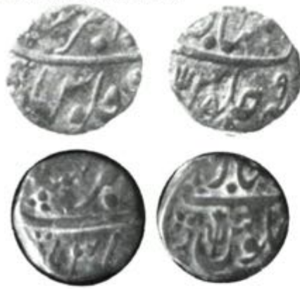
figs. 28, 29

Peshwas, but as we have seen in case of rupees bearing similar RY, this attribution is by no means certain.