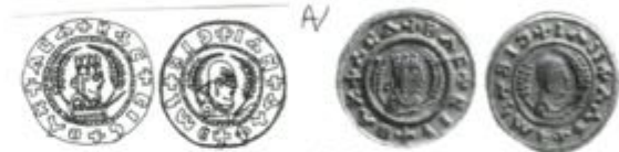
H. 28 Noe