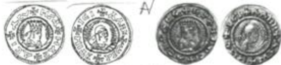
H. 21b Ezana posthumous